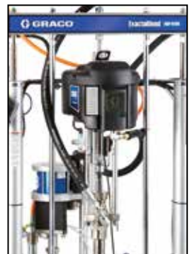
ExactaBlend AGP U100 for Urethanes