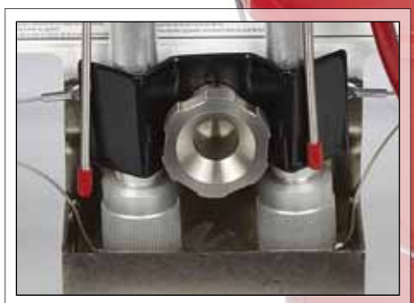
Holster for Suction Lines Keeps tubes in place during transport; prevents drips.