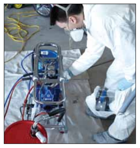
Set - Get ready to spray in a matter of minutes.