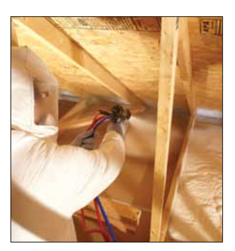
Spray - Ideal for attics and rim joists.