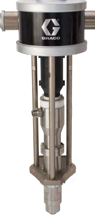
Merkur Bellows Pump

All written and visual data contained in this document are based on the latest product information available at the time of publication. Graco reserves the right to make changes at any time without notice.