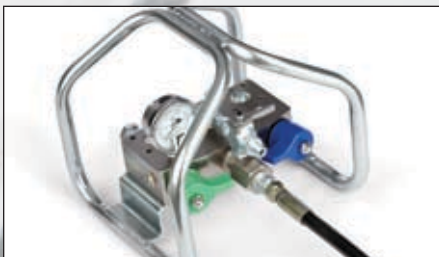
Remote Mix Manifold

Material mixing reaches a new level of precision due to new dosing technology. With the Graco XM, the minor component (or side B material) is injected at high pressure into the major material (side A). Advanced sensors allow pumps to compensate for pressure fluctuations, resulting in accurate, on-ratio mixing for better yield and less waste.