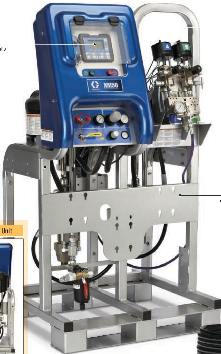
Graco XM Plural-Component Sprayer (base model)*

Xtreme pumps and Merkur™ flush pump are standard on the base unit. Easy crane transport using eye hooks on air motors.