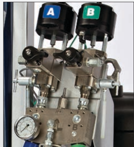
Standard Mix Manifold

Choose standard, frame-mounted mix manifold or remote mix manifold; both include a pressure gauge that displays fluid output pressure.