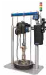
D200 Ambient Supply System