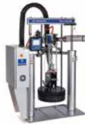
Therm-O-Flow® 200 Hot Melt System