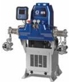
HFR Metering System