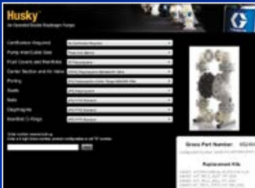
Example of Product Selector Tool

To order a Husky pump, go to www.graco.com/husky to use the selector tool or contact your distributor.