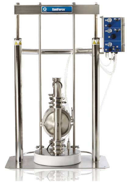
SaniForce 3150 Drum Unloader

All written and visual data contained in this document are based on the latest product information available at the time of publication. Graco reserves the right to make changes at any time without notice.