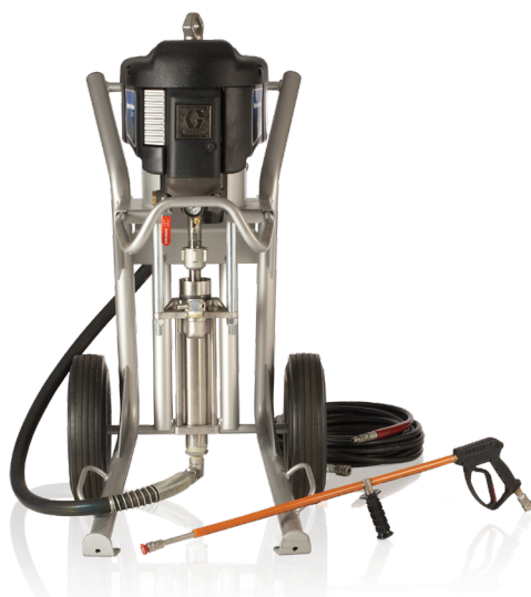
Hydra-Clean® Pressure Washers

Our industrial equipment offers a complete line of priming piston and air-operated double diaphragm pumps for low to high viscosity fluids for a wide range of applications.