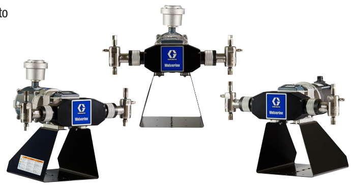
Wolverine Hazardous Location Pumps

Low friction drivetrain to optimize electrical efficiency, reducing the load on your power system.