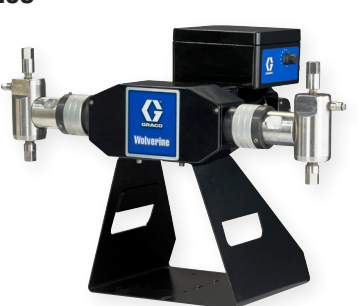
Wolverine Variable Speed Pump