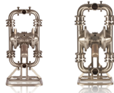
SaniForce 1590 HS