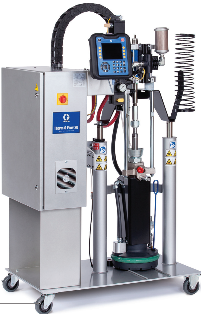
Therm-O-Flow 20 (5 gal)