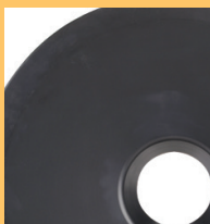
55 gal (200 l)