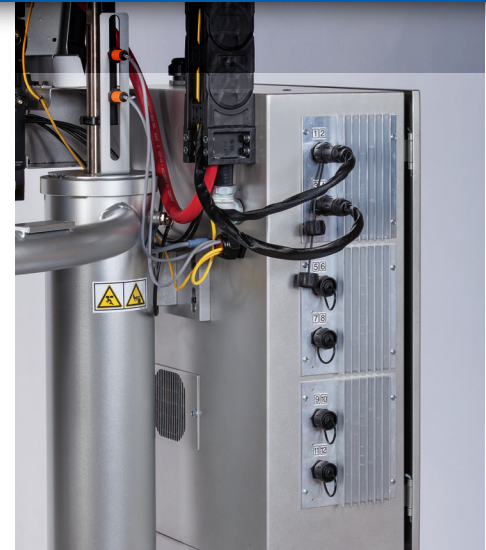
Six connection points for the 12 customer defined heat zones

Graco offers a complete line of Therm-O-Flow bulk hot melt systems and "point of use" melt systems – each can be configured to fit your specific application.