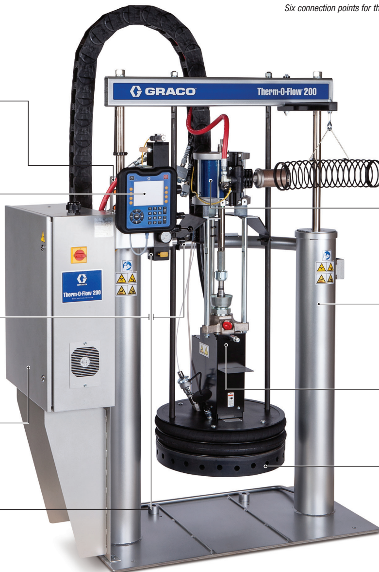
Therm-O-Flow 200 (55 gal)

Easy-to-maneuver casters are sold as a kit for the 5 gallon system