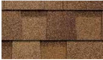
Desert Tan †

See map for colour availability in your area