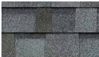
Quarry Gray †