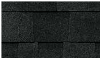
Onyx Black †