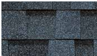
Harbour Blue † Not Available in Regions 2 & 3