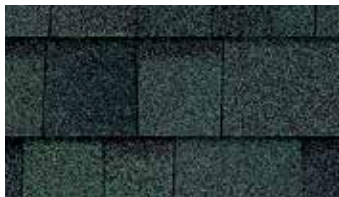
Chateau Green †