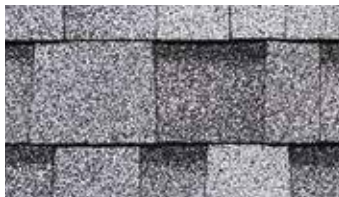
Sierra Gray †