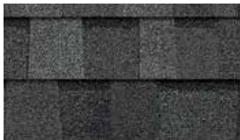
Estate Gray †