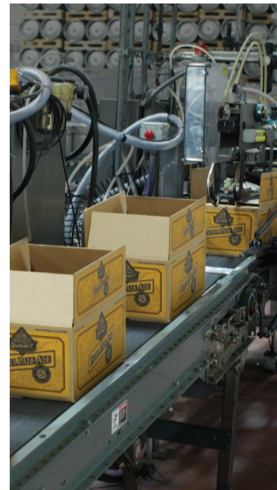
Charred hot melt adhesive causes nozzle plugging, leading to downtime on the packaging line.

Charring: Tank systems maintain large volumes of molten adhesives for hours or days. This long heat soak leads to glue charring. Charring also happens when the level of molten glue is allowed to vary widely. The glue on the side walls, exposed to the atmosphere, chars very quickly. The charred material will cause plugging in nozzles, leading to downtime on the packaging line. This excessive charring can also lead to premature failure of fluid seals in pumps and guns.