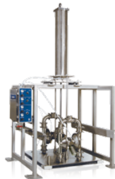
SaniForce 3150 BES

All written and visual data contained in this document are based on the latest product information available at the time of publication. Graco reserves the right to make changes at any time without notice.