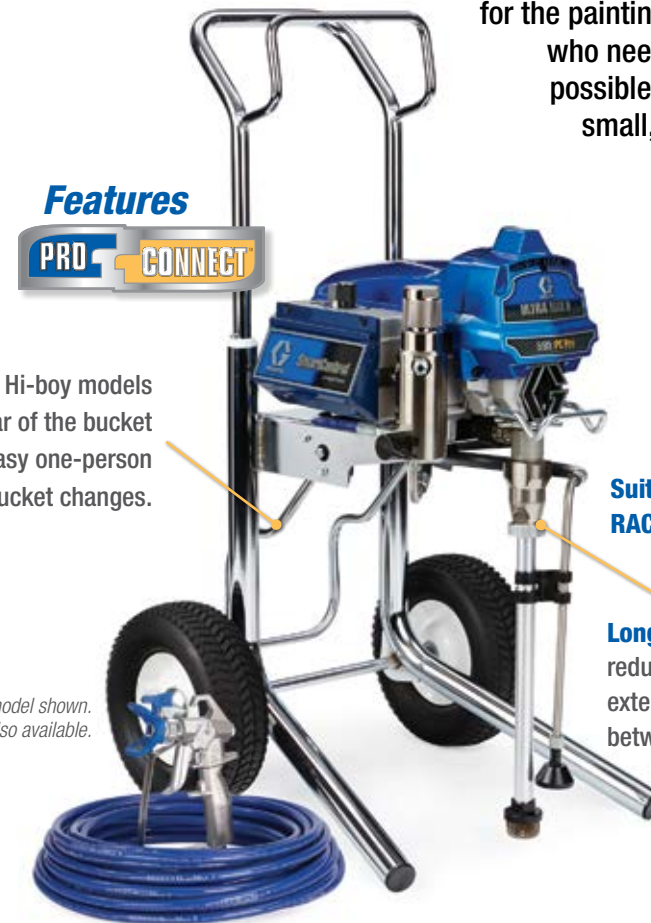
Hi-Boy model shown. Lo-Boy model also available.

Long Stroke Pump reduces wear and extends time between repacks.