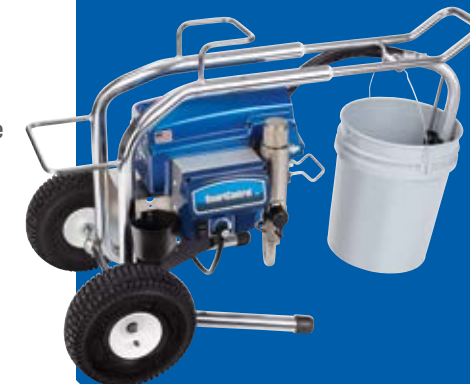
Lo-Boy easily carries a standard 19-litre paint bucket.