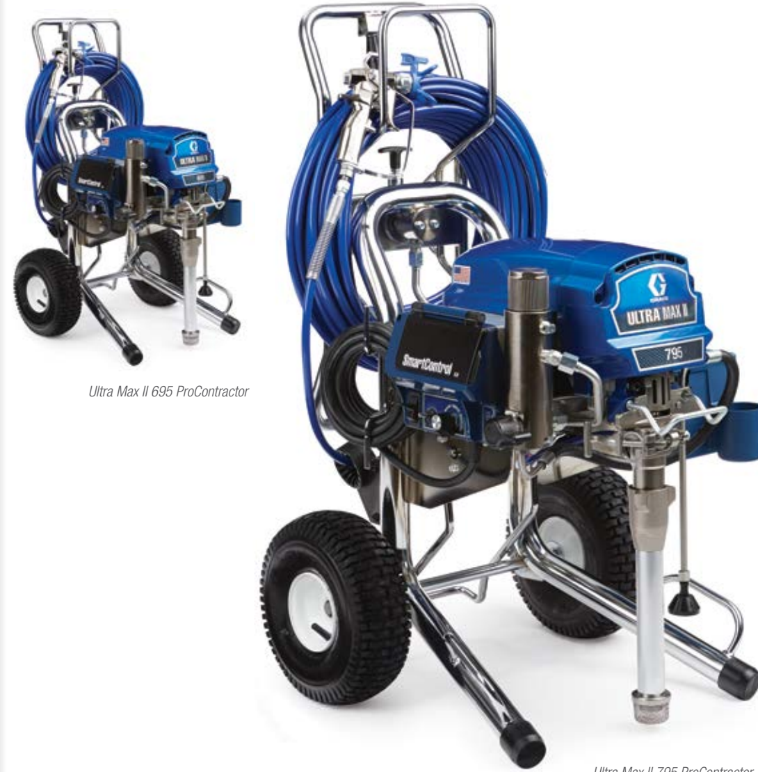
Ultra Max II 695 ProContractor