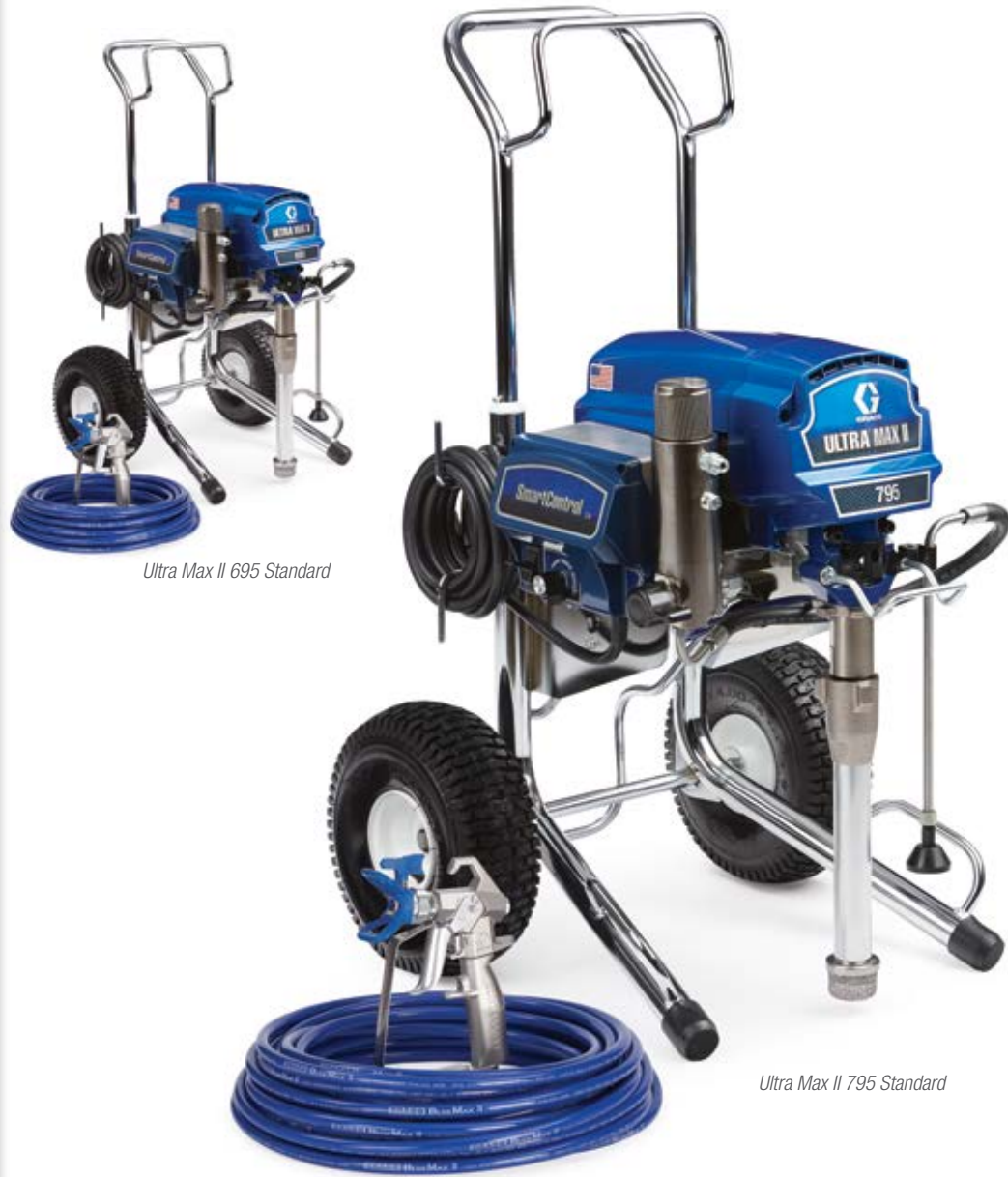
Ultra Max II 695 Standard