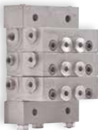
The industry standard for natural gas engines and compressors