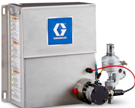
G3000 Meter Fluid Panel for grease and paint