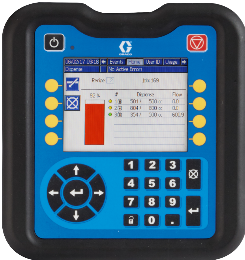
Advanced Display Module (ADM)