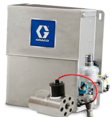
Helical Gear Meter Fluid Panel for high viscosity fluids