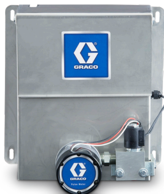
Oil Meter Fluid Panel for lubricants and oil