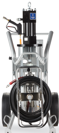
Hydra-Clean Hydraulic Cart-Mount*