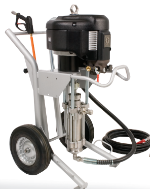
Hydra-Clean Air-Operated Cart-Mount