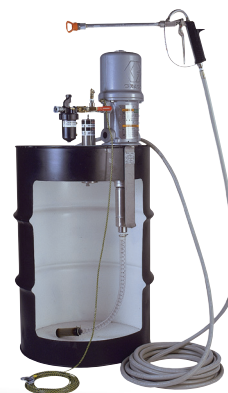
Hydra-Clean Air-Operated 10:1 Drum-Mount