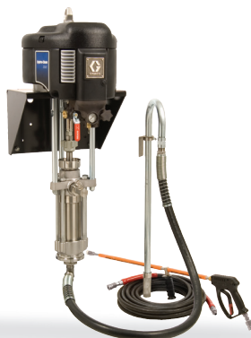
Hydra-Clean Air-Operated Wall-Mount

*Hose Reel is only included with cart mount package 24W474