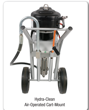
Hydra-Clean Air-Operated Cart-Mount