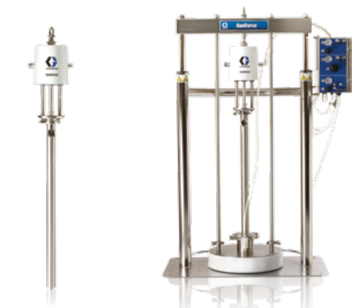
SaniForce 6:1 Piston Pump